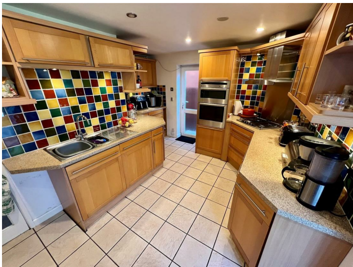
Having UPVC double glazed door to the side, recessed ceiling spotlights, central heating radiator, tiled flooring and being fitted with a range of wall and base mounted storage units with work surfaces over having inset 1.5 bowl sink and