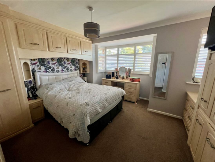
Having UPVC double glazed bay window and additional UPVC double glazed light release window the front, ceiling light point, central heating radiator and fitted bedroom furniture