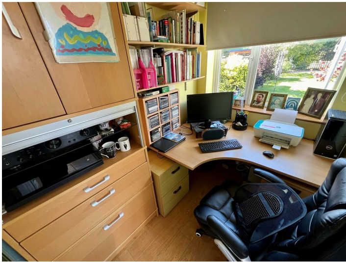
Having UPVC double glazed window to the rear, ceiling light point and central heating radiator