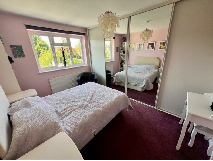
Having UPVC double glazed window to the rear, ceiling light point, central heating radiator and built in wardrobes